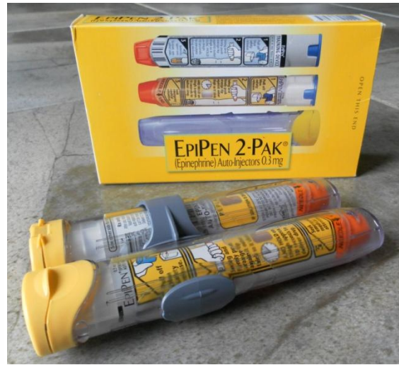
EpiPen Auto-Injector 0.3mg (yellow label) removed from carrier tube